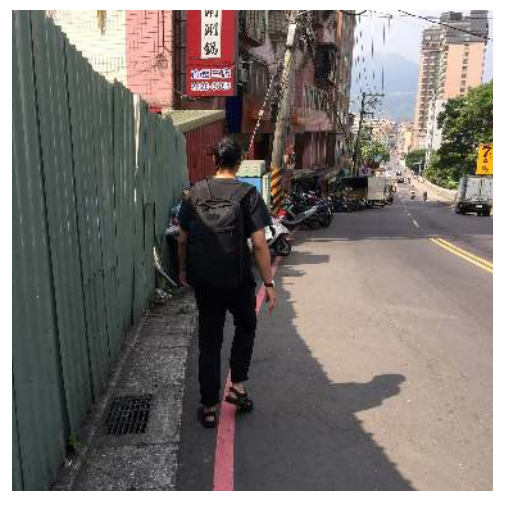
With the GORUCK GR1