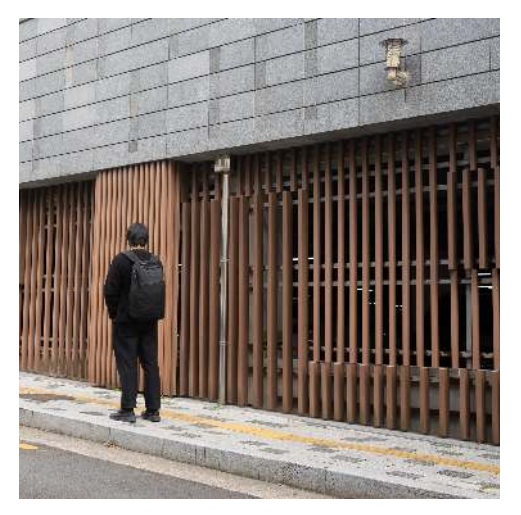
With the <u>GORUCK GR1</u>, <u>Outlier Bombdeux</u>, and <u>GORUCK MACV-2</u>

Smaller and lighter things are often enough (See #004). They take up less space and are more portable. Most people don't need the biggest or the best of everything.